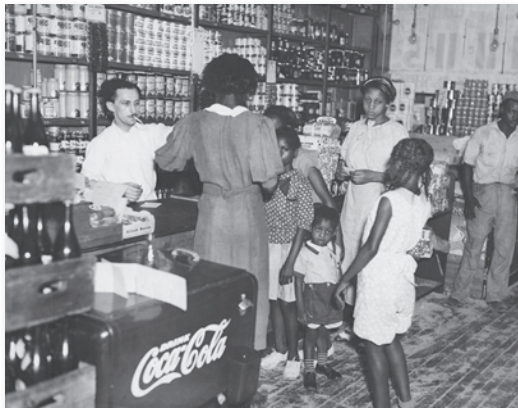
▲ Photo 1.4 Mid-20th Century African American Youth

Some African Americans are now millionaires, but the gap in wealth between average African Americans and whites is much greater than the gap between incomes. The African-American middle class continues to grow, but many of its members barely have a toehold in it, and some are only a few paychecks away from a return to poverty. And the African-American poor still face the most formidable obstacles to upward mobility. Close to a majority of working-age African-American men are jobless or out of the labor force. Many women, including single mothers, now work in the low-wage economy, but they must do without most of the support systems that help middle-class working mothers. Both federal and state governments have been punitive, even in recent Democratic administrations, and the